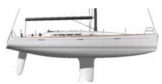
Deep draught keel