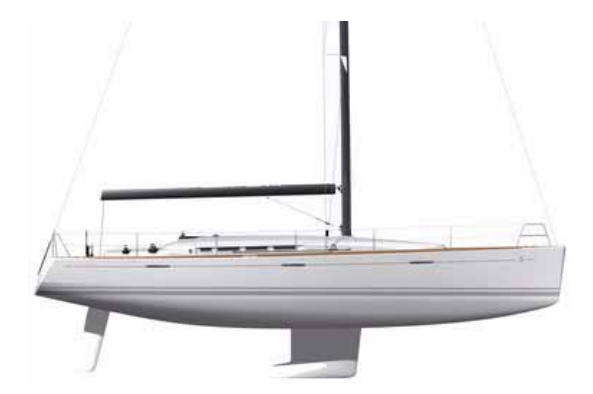
Short draught keel