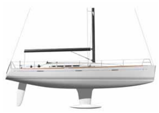
Shallow draught keel